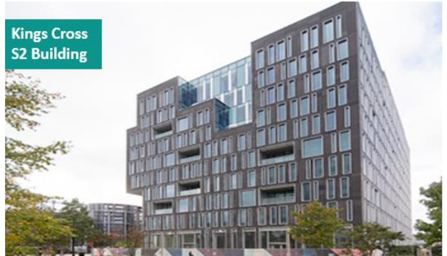
Kings Cross S2 Building