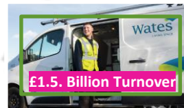
£1.5. Billion Turnover