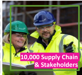
10,000 Supply Chain & Stakeholders