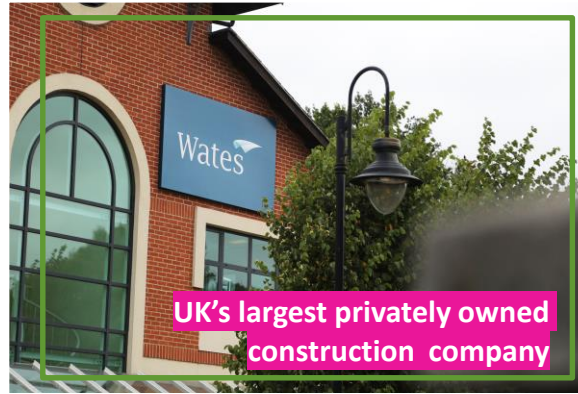
UK's largest privately owned construction company