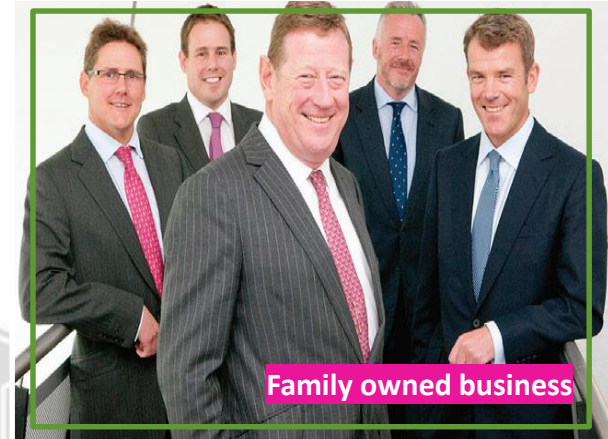
Family owned business